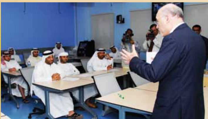
Leo Apotheker, CEO of SAP AG., talks with students at Abu Dhabi Men's College.