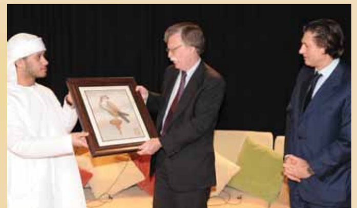
John R. Bolton, former US Ambassador to the United Nations accepts a painting at the Higher Colleges of Technology.