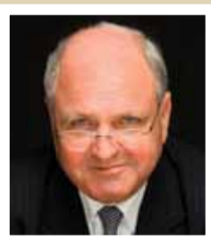
Rt. Hon. Mike Moore Former Director General, World Trade Organization, New Zealand

Are women part of that society or not? And if women are a part of the society, what is their role in alleviating such challenges. Should women be mere observers in the problems of the societies? Should they wait at home and await decisions made for them by their fathers and their husbands or should they be active citizens and play a useful part in resolving the problems of their societies? This is one of the most important issues that you have to pay attention to.