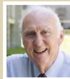
Professor Martin Perl Nobel Prize in Physics, 1995, USA

Science, especially basic science, really has no national boundaries and has been always an example of openness and lack of nationalism as compared to just about anything else: because after all, especially in basic sciences, our master is not the government or ideology but rather nature. Nature poses the problems and nature judges our successes or failures.