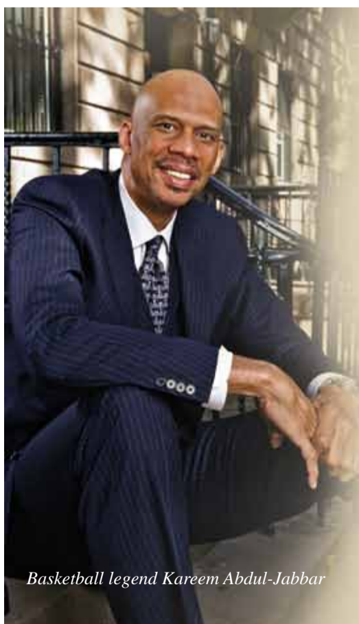
Basketball legend Kareem Abdul-Jabbar