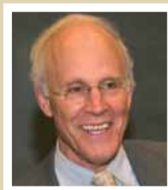
Dr. David Gross Nobel Prize in Physics, 2004, USA

Is GDP the only measurement we need to establish if a country has developed or not? Shouldn't we measure other kinds of variables within a country? think about poor people not as a burden on the society but as a true asset of that society.