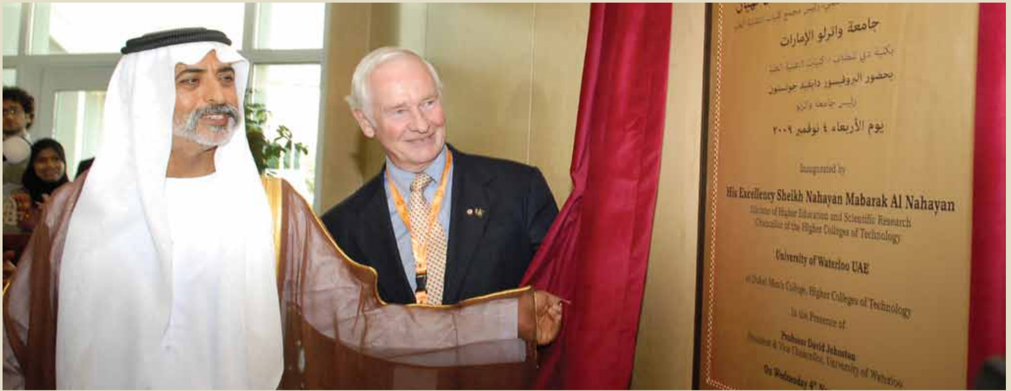
HE Sheikh Nahayan Mubarak Al Nahayan, Minister of Higher Education and Scientific Research and Chancellor of the Higher Colleges of Technology, with University of Waterloo President David Johnston at the opening of the international campus.

The University of Waterloo, in partnership with the Higher Colleges of Technology (HCT), launched Bachelor of Applied Science degrees in chemical and civil engineering at the Dubai Men's College campus. In September 2010, it plans to offer a Bachelor of Mathematics in information technology management and another in financial analysis and risk management.