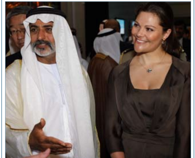
HE Sheikh Nahayan Mabarak Al Nahayan and Crown Princess Victoria of Sweden at the official opening of the Nobel Museum exhibition at Dubai Men's College.

THE Higher Colleges of Technology (HCT) proudly launched the global tour of Sweden's Nobel Museum exhibition, Alfred Nobel: Networks of Innovation , which is open at Dubai Men's College until 29 May 2008.