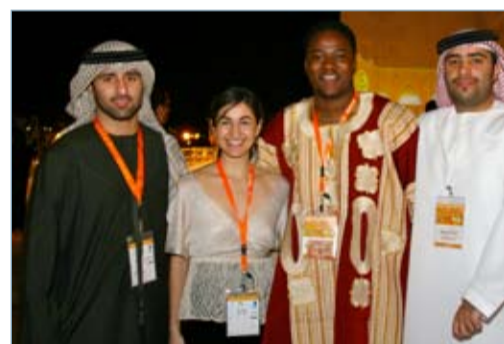
HCT students greet international peers at Education Without Borders 2007.

“It was, is and always will be an honour to be a HCT student, especially of the DMC. The days of hard work, exams and projects throughout the years did put a lot of stress on us but at the end brought out nothing except the maximum best in us. We discovered a lot of new and interesting things which will remain with us all our lives. The type and quality of education has expanded our thoughts and built strong confidence. Thus, we not only look forward to achieving good status in our social lives and careers after graduation, but also to be leaders wherever we go.”