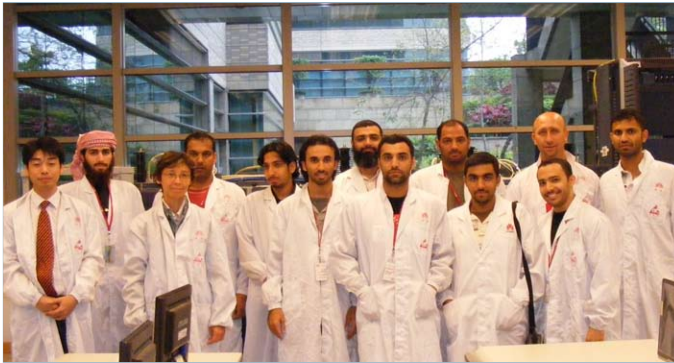
HCT students in the Huawei offices in China.

TWELVE Higher Colleges of Technology (HCT) students recently participated in a two-week training program in China, with telecommunications giant Huawei Technologies.