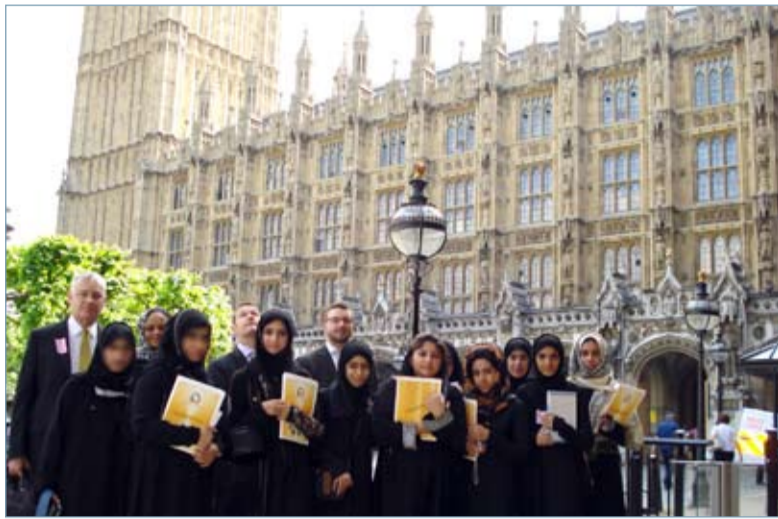
Sharjah Women's College students