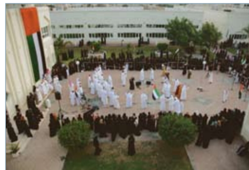
Fujairah Women's College national day celebrations.