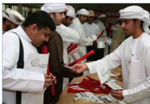
Dubai Men's College students participate in the Watani program as part of national day celebrations.