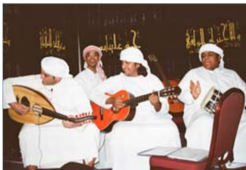
Music at lunch at Sharjah Men's College during Mosaic 2007.