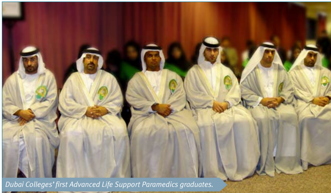
Dubai Colleges' first Advanced Life Support Paramedics graduates.

IN the presence of His Excellency, Sheikh Nahayan Mubarak Al Nahayan, Minister of Higher Education and Scientific Research, Chancellor of the Higher Colleges of Technology (HCT), fourteen UAE national students graduated from the HCT Dubai-based Paramedic Program.