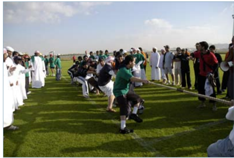
Al Ain Men's College put their strength to the test at sports day.