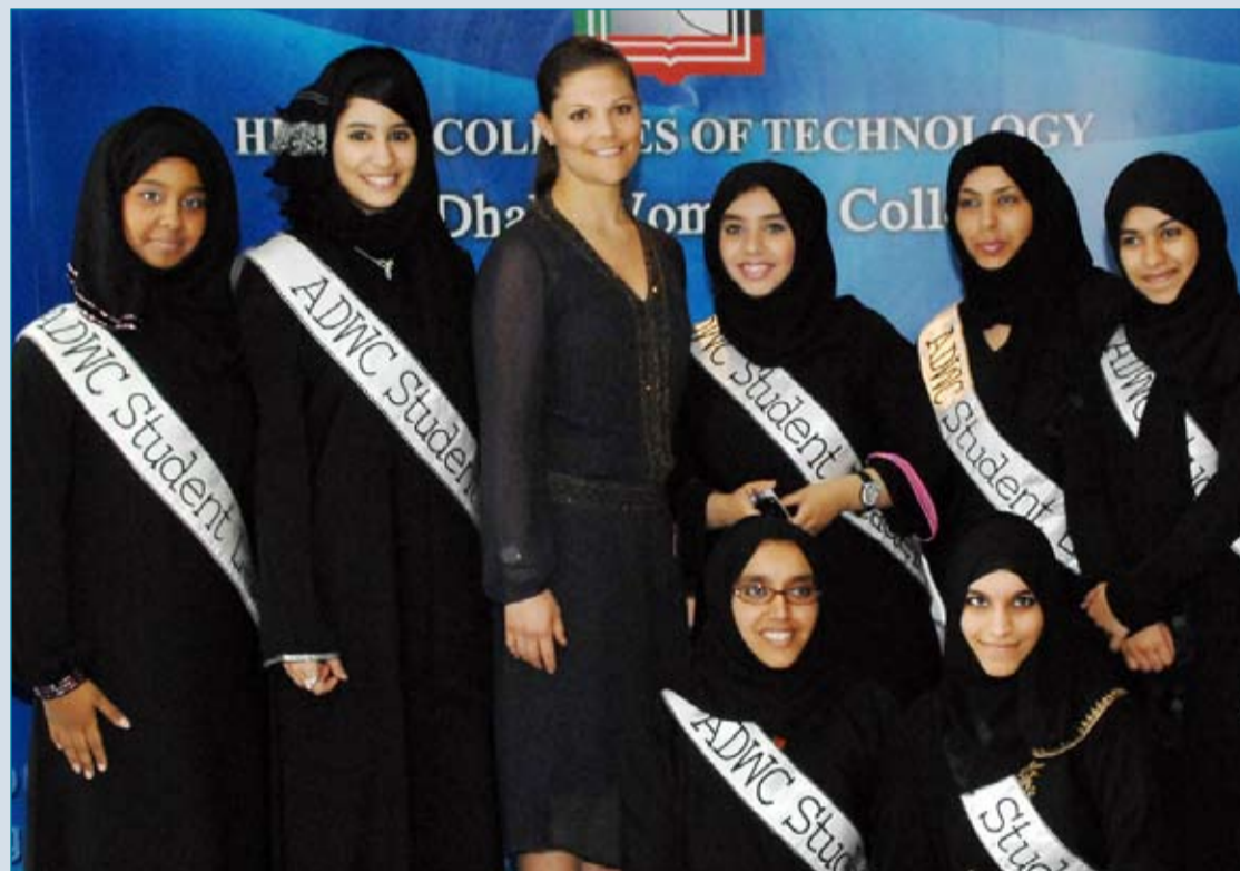
Crown Princess Victoria of Sweden visited Abu Dhabi Women's College (ADWC) during her recent trip to the United Arab Emirates for the opening of the Nobel Museum exhibition. ADWC Student Council members were thrilled to meet the Princess.