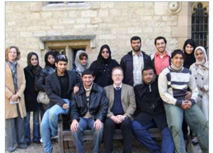
The students at Oxford University.

FOURTEEN HCT students participated in an eight day orientation program at Oxford University in the United Kingdom to learn about its history and academic integrity.