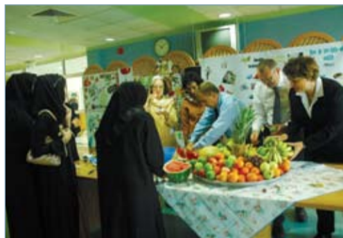
Ras Al Khaimah Women's College students promote healthy eating.