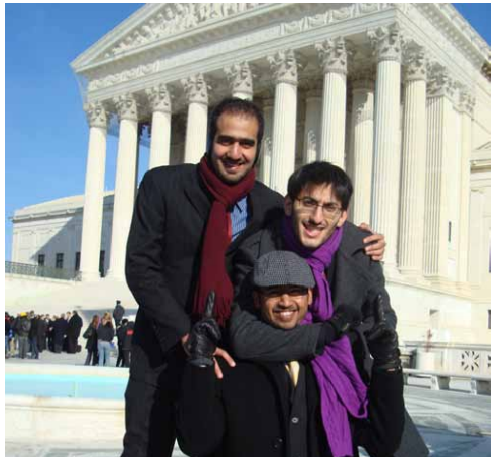
The 2008 Sheikh Mohammed bin Zayed Scholars in Washington D.C.