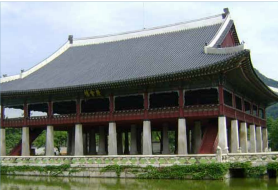
Harvard Project for Asian and International Relations (HPAIR) Academic Conference in Seoul, Korea in mid-August.”

Throughout the conference, they were able to provide a uniquely Arab perspective on the topics discussed. The students also engaged actively in cultural exchange, applying henna to Korean hands while sampling Korean cuisine. Students have now returned to the UAE with an enhanced global perspective having successfully attended their first high-caliber international conference.