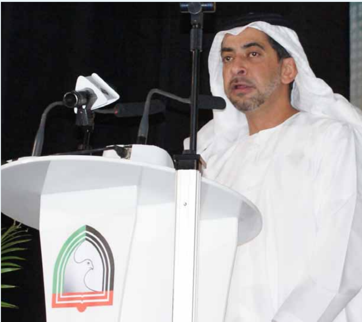
His Highness Sheikh Hamdan bin Zayed Al Nahyan at the graduation ceremony.

On June 23rd, a historic event occurred at Madinat Zayed and Ruwais Colleges. A graduation of the first diploma cohort was held, with 60 students receiving their diploma certificates; 40 from Madinat Zayed Women's, 10 from Madinat Zayed Men's, and 10 from Ruwais colleges.