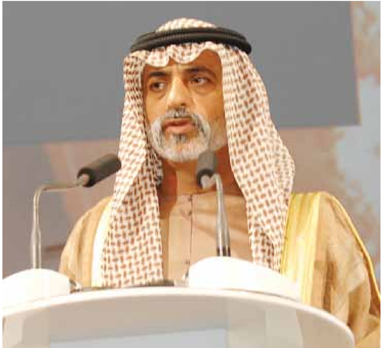
HE Sheikh Nahayan Mubarak Al Nahayan.