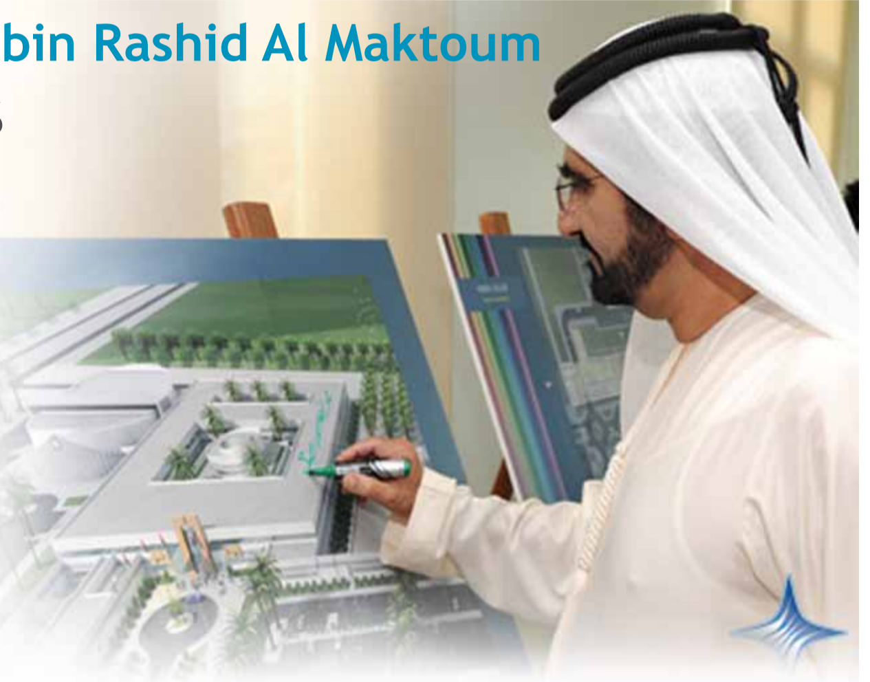
HH Sheikh Mohammed bin Rashid Al Maktoum signs the new design for Ras Al Khaimah Women's College

HH Sheikh Mohammed next traveled to the men's campus where he commenced his visit by meeting with students who presented recent end of year Diploma and Higher Diploma Mechatronics projects. Given the number of excellent students who have graduated from the Men's HD Engineering program, the Vice President proposed that resources should be set aside to establish a "top up" Bachelor's degree in engineering. Sheikh Mohammed visited many classes at the Men's College, including the CERT Military program. In the "Open Access Center" he met new Foundations students, sharing a smile and loads of encouragement for the challenges ahead.