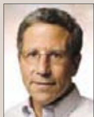
Dr. Eric Maskin