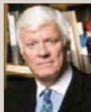
John Young Brown Jr.