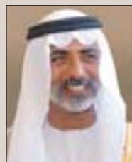
H.E. Sheikh Nahayan Mubarak Al Nahayan