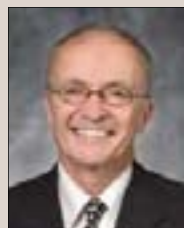
Prof. Finn E. Kydland